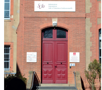
SUIO-IP THE ADVICE - RESOURCES -COUNSELLING SPACE

Room AF 144 Older Faculties Reception 1st floor of SUIO-IP Monday: 12:30-17:00 Tuesday, Wednesday-Thursday: 9.30am-5pm Priday: 9.30am-5pm Phone: 05.61.63.37.28